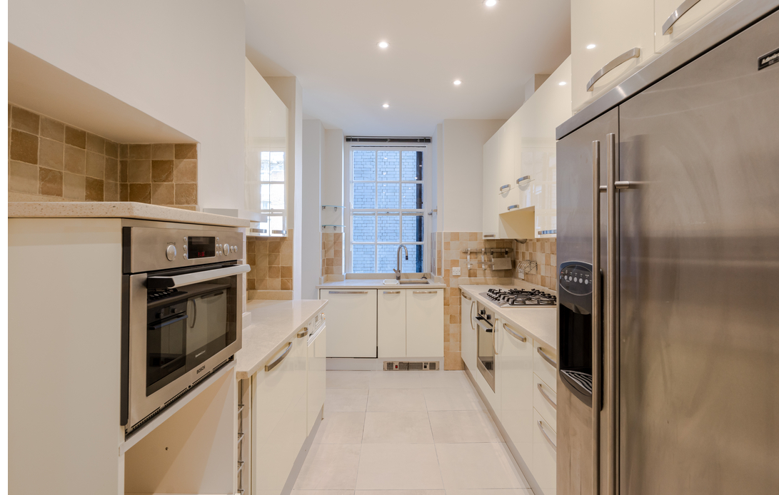
Flat 84, 6-8, Rodney Court,, Maida Vale, London, W9 1TJ £1,250 p/w