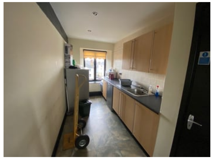
with oak effect base and wall units, stainless steel sink and drainer with mixer tap, rear window.