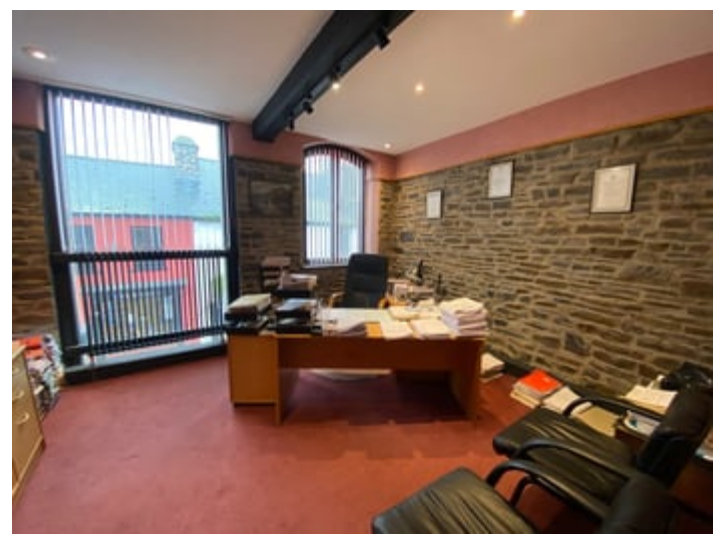
12' 7" x 14' 2" (3.84m x 4.32m) a luxurious office space with large arched windows to front, radiator, exposed stone walls,