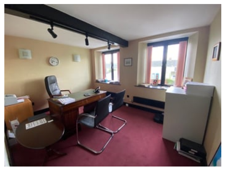
13' 5" x 12' 9" (4.09m x 3.89m) with 2 rear windows, exposed beams to ceiling, multiple sockets, radiator.