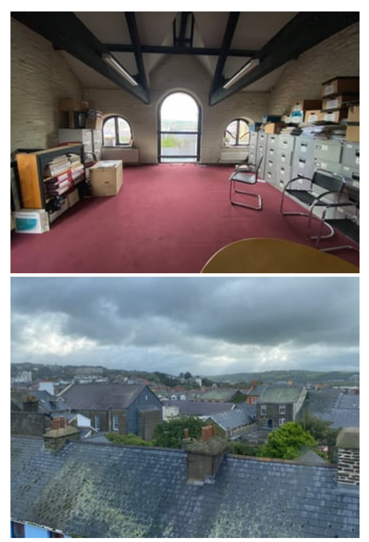
towards the National Library and the Cambrian mountains, radiator, exposed beams and 'A' frames to ceiling.