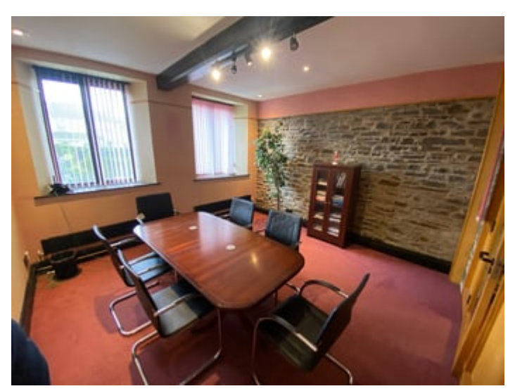
14' 0" x 13' 2" (4.27m x 4.01m) accessed via oak doors and side panelling to a well lit meeting room with 2 widows to rear, BT point, multiple sockets, radiator.