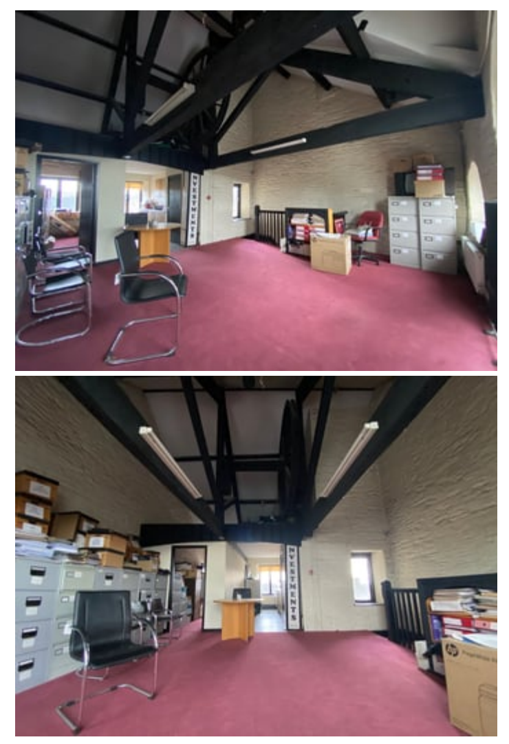
17' 7" x 20' 9" (5.36m x 6.32m) a large open span office and storage space with potential for providing Managers Accommodation (stc) with large arched windows to front with side windows, enjoying views over Aberystwyth town