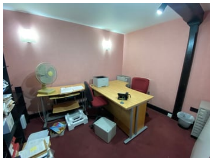
8' 10" x 11' 6" (2.69m x 3.51m) multiple sockets, radiator.