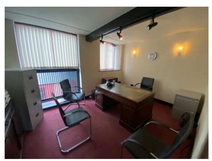
12' 4" x 14' 4" (3.76m x 4.37m) with large window to front, multiple sockets, radiator.