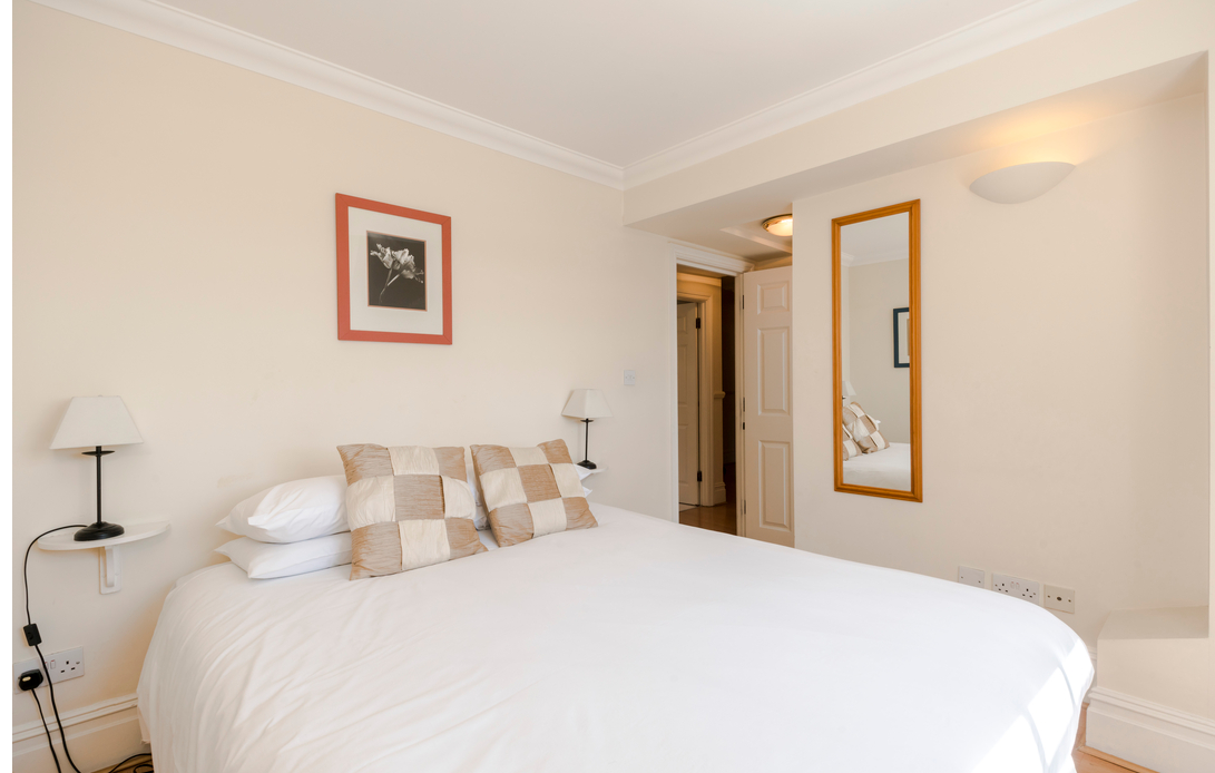
Flat 17, 117 York Place Mansions, Baker Street, Marylebone, London, W1U 6RX £825 p/w