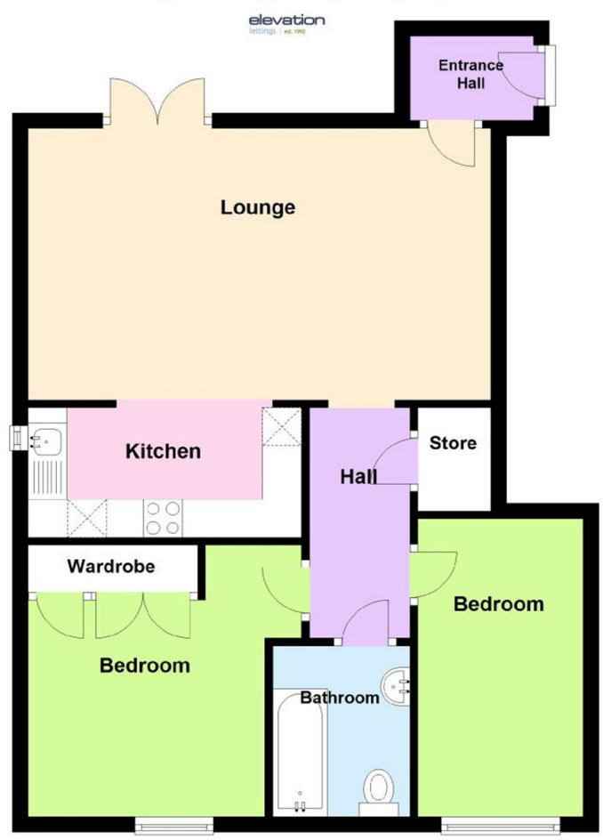
Total area: approx. 59.9 sq. metres (644.9 sq. feet)

Approx. 59.9 sq. metres (644.9 sq. feet)