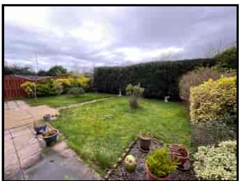
25 Glanrheidol Llanbadarn Fawr, Aberystwyth, Ceredigion. SY23 3GG.