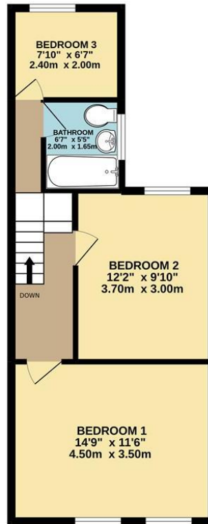
TOTAL FLOOR AREA : 944 sq.ft. (87.7 sq.m.) approx.

Whilst every attempt has been made to ensure the accuracy of the floorplan contained here, measurements of doors, windows, rooms and any other items are approximate and no responsibility is taken for any error, omission or mis-statement. This plan is for illustrative purposes only and should be used as such by any prospective purchaser. The services, systems and appliances shown have not been tested and no guarantee as to their operability or efficiency can be given. Made with Metropix ©2022