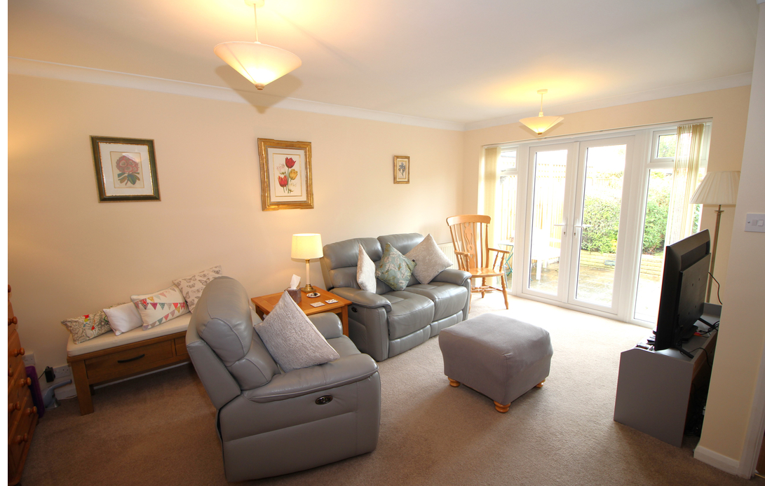
15 Chessholme Road, Ashford, Surrey TW15 1LG £610,000 - Freehold