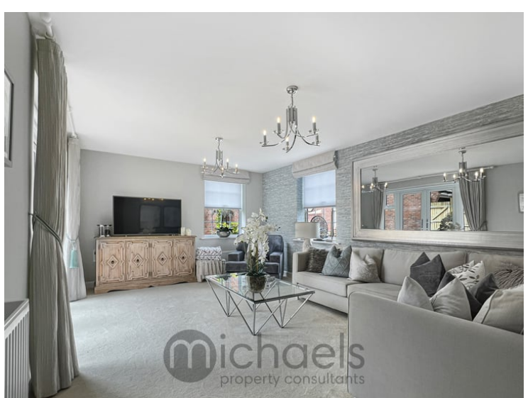
18' 5" x 12' 2" (5.61m x 3.71m)