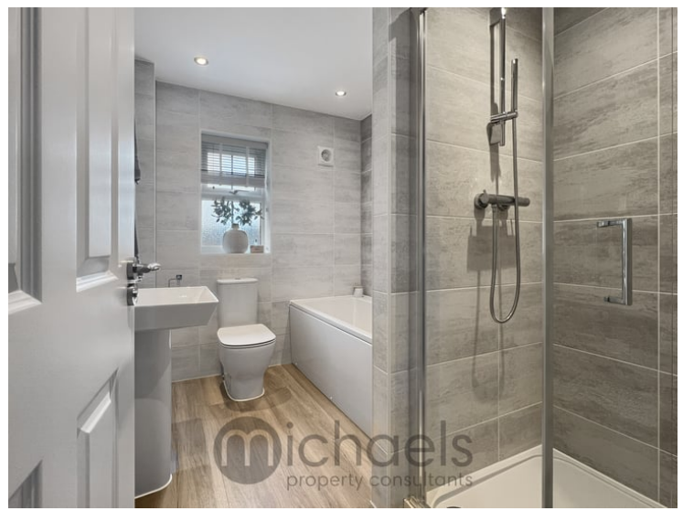
8' 10" x 6' 7" (2.69m x 2.01m)