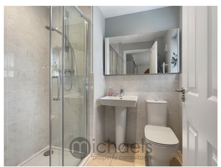
5' 7" x 6' 10" (1.70m x 2.08m)