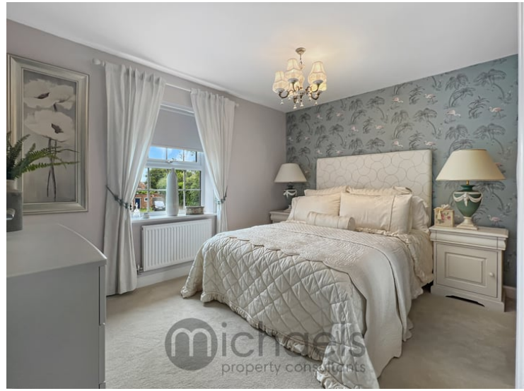
14' 6" x 9' 3" (4.42m x 2.82m)