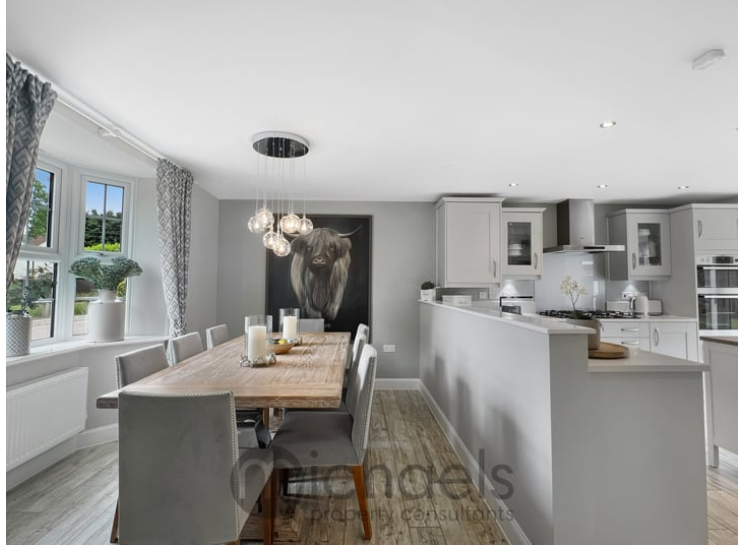
13' 5" x 9' 7" (4.09m x 2.92m)