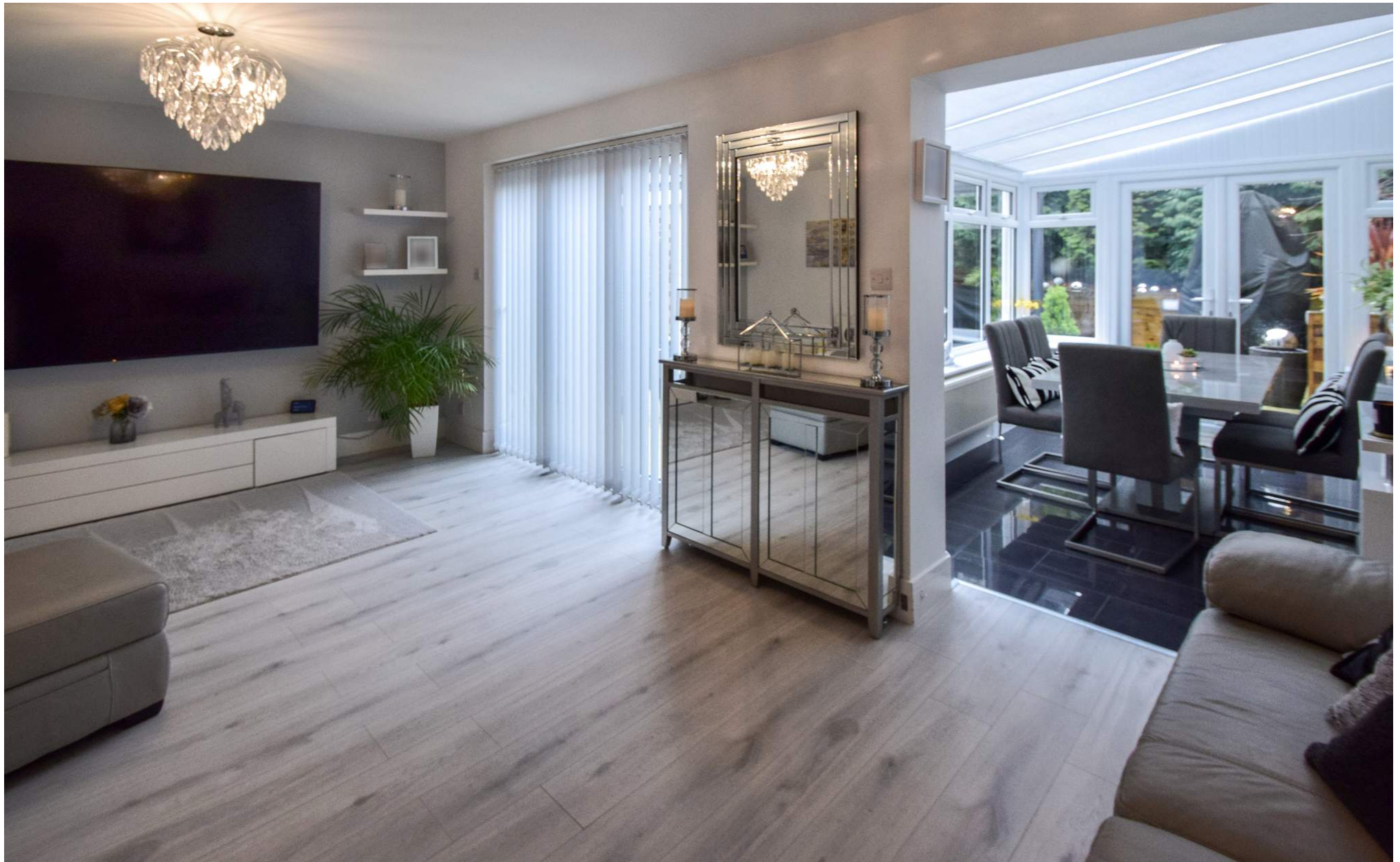
FALLOWFIELD, WAYFIELD, CHATHAM, KENT, ME5 0DX