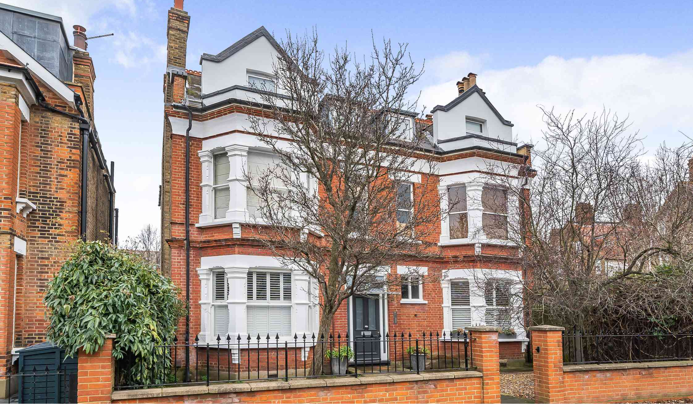
St Marys Grove, London, W4 3LW