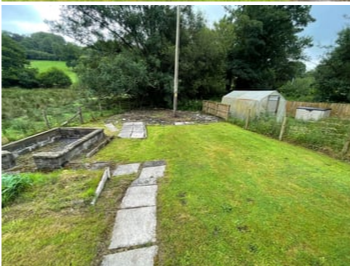
Useful General Purpose Building