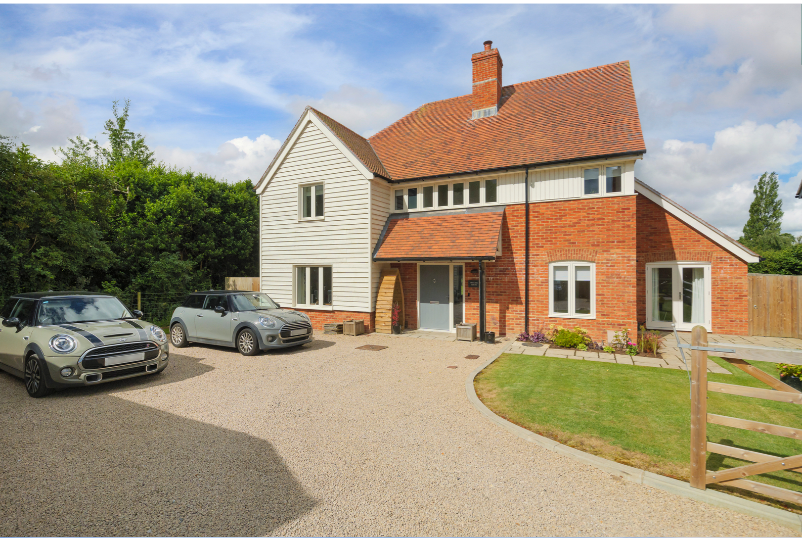
Skylark House, 4, Rose Lane, Stelling Minnis, Canterbury. CT4 6FF

A charming spacious four bedroom family home situated in a small desirable development in rural village of Stelling Minnis. This delightful property combines the best of modern living with a traditional village-style exterior and contemporary interior design throughout. EPC RATING = C