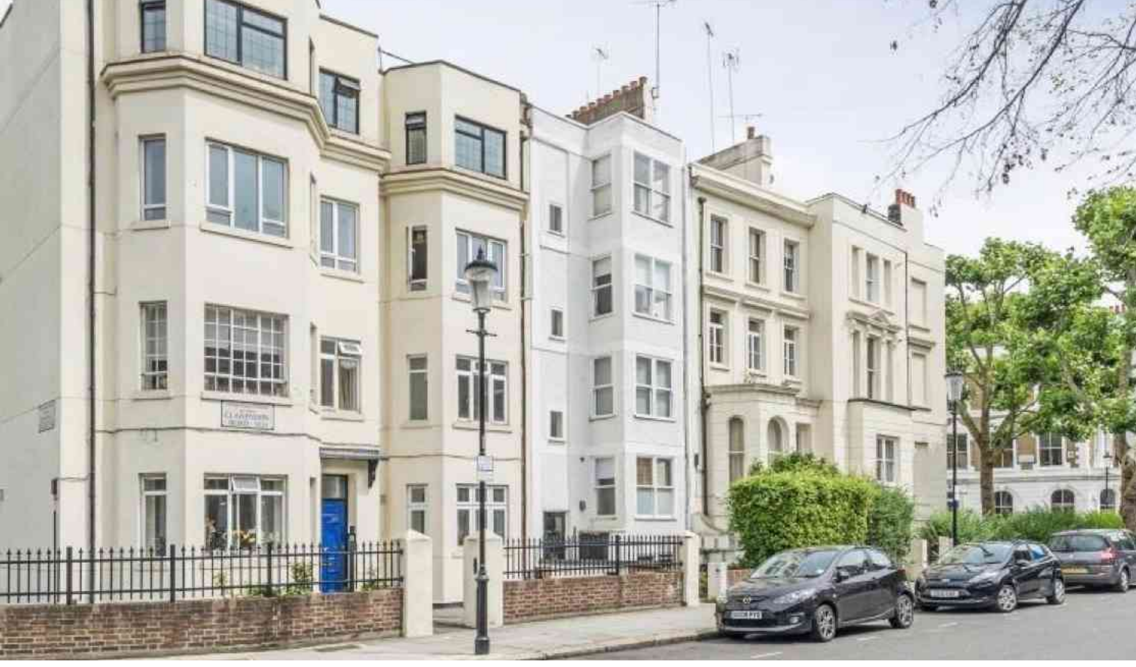
Clarendon Road, London, W11 1SA