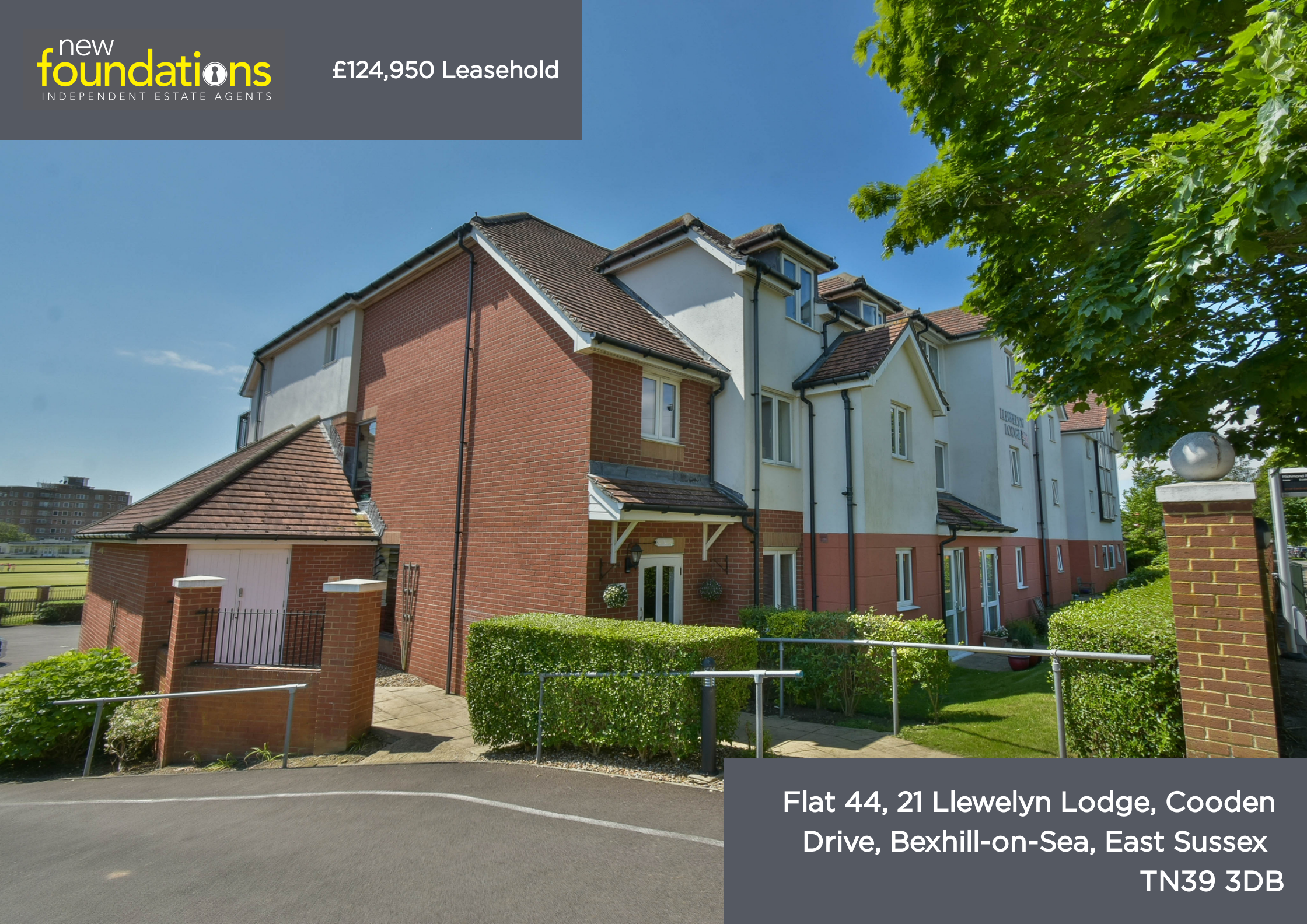
Flat 44, 21 Llewelyn Lodge, Cooden Drive, Bexhill-on-Sea, East Sussex TN39 3DB