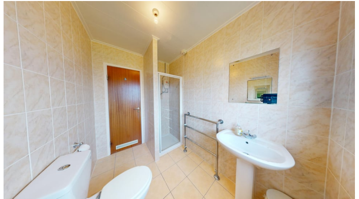
1.76m x 2.69m En Suite