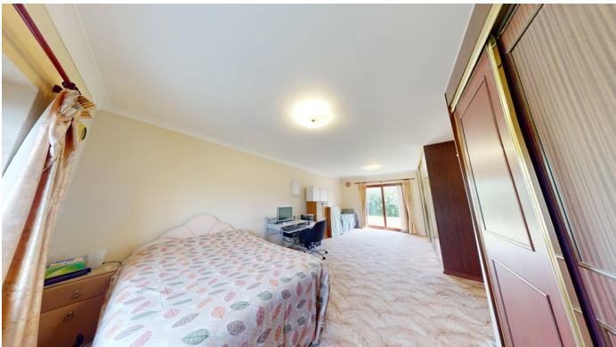
5.81m x 7.29m (19' 1" x 23' 11")