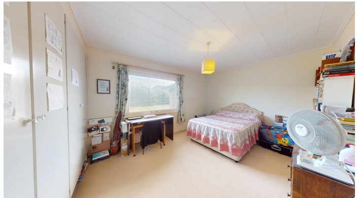
3.93m x 2.69m (12' 11" x 8' 10")