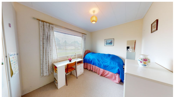
4.28m x 3.33m (14' 1" x 10' 11")