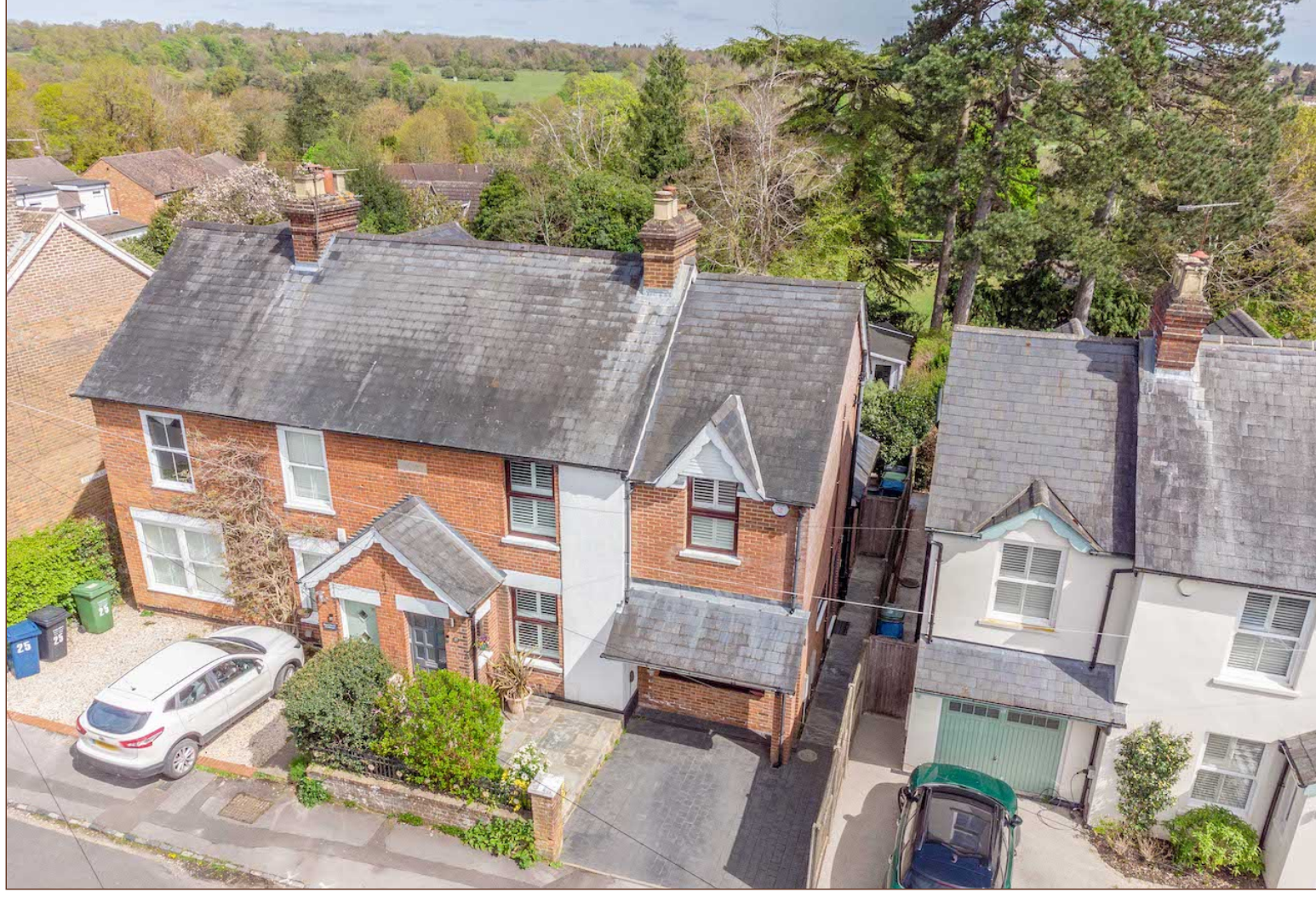
A charming extended Victorian property nestled in the picturesque village of Chalfont St Giles. Beyond its quaint exterior lies a spacious and meticulously maintained 4/5 bedroom semi-detached home, boasting a perfect blend of period features and modern comforts.

Upon entry, you're greeted by a welcoming porch leading into the expansive living room adorned with original wood floorings, where the focal point is a striking ornamental fireplace, creating a cozy ambiance. The journey continues into the heart of the home - a generously proportioned kitchen featuring bi-folding doors that seamlessly connect indoor and outdoor living spaces. The kitchen is well-appointed with a gas hob, elegant wooden work surfaces, and abundant floor and eye-level units. Here, you'll find ample space for dining and a convenient breakfast bar area, perfect for casual meals or entertaining guests.