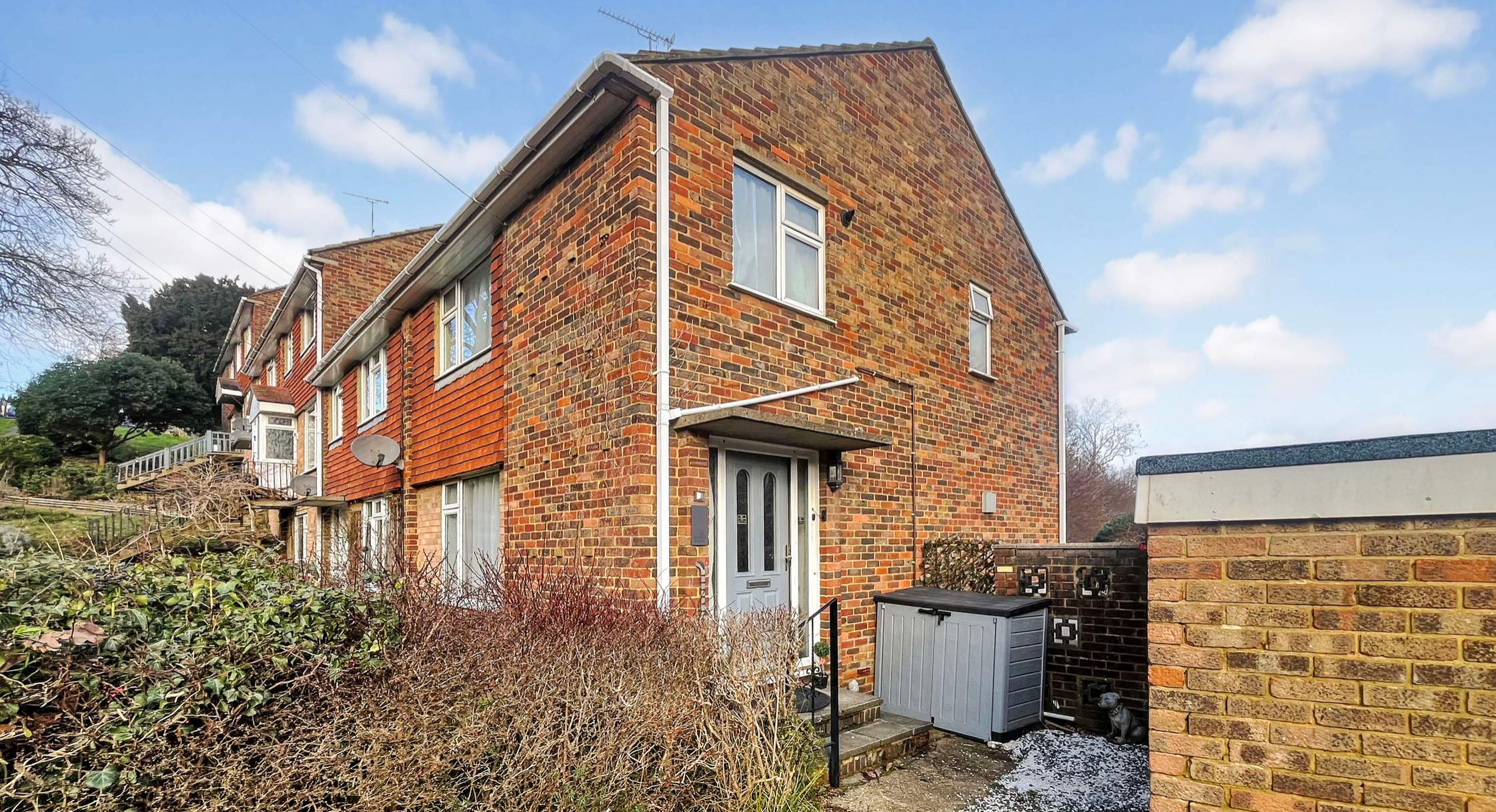
Three Bedroom End of Terrace House Sutherland Gardens, Rainham, Gillingham, Kent, ME8 9LZ