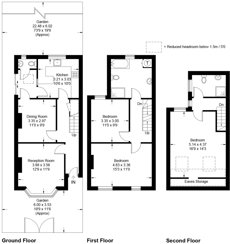
Illustration for identification purposes only, measurements are approximate, not to scale. Fourlabs.co © (ID1176787)