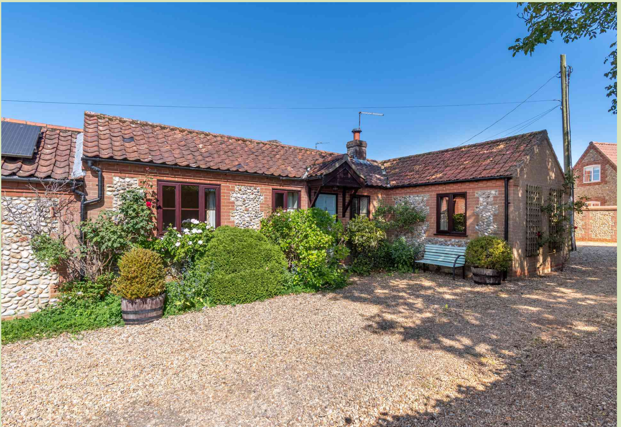
2 Stable Cottage, Helhoughton Guide Price £250,000