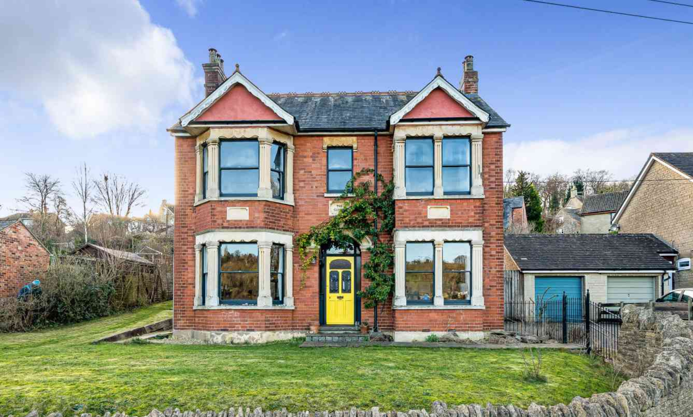
The Gables, Northfields Road, Nailsworth, GL6 0NB £895,000