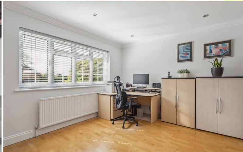
Cherry Acre Chalfont St Peter, Buckinghamshire, SL9 0SX