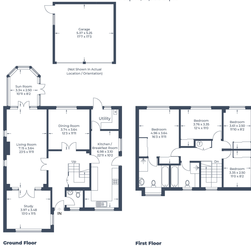
Illustration for identification purposes only, measurements are approximate, not to scale. © CJ Property Marketing Produced for Rodger's Estate Agents