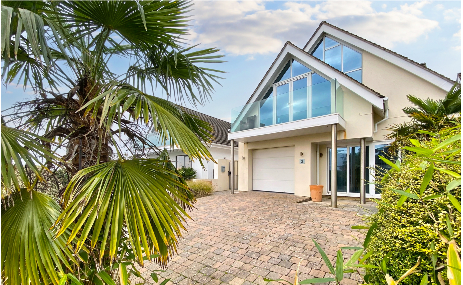
Partridge Drive, Lilliput BH14 8HJ