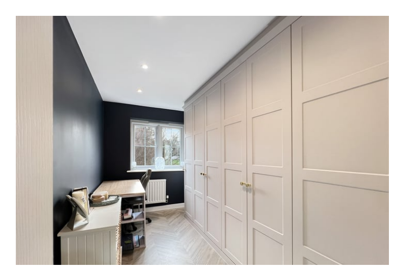
6' 7" x 13' 1" (2.01m x 3.99m)