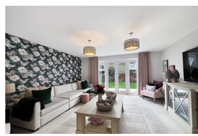
15' 4" x 16' 4" (4.67m x 4.98m)