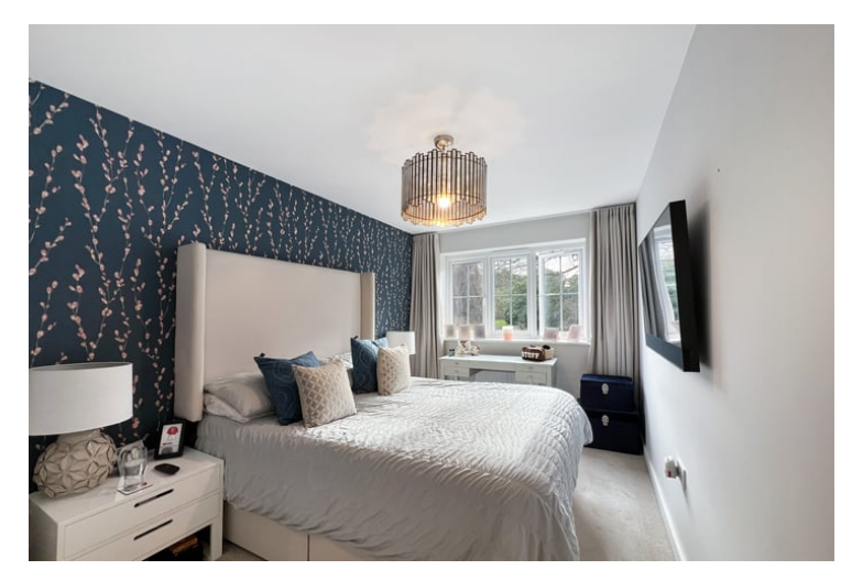
8' 5" x 19' 3" (2.57m x 5.87m)