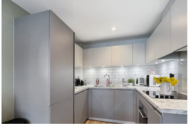
8' 0" x 14' 0" (2.44m x 4.27m)