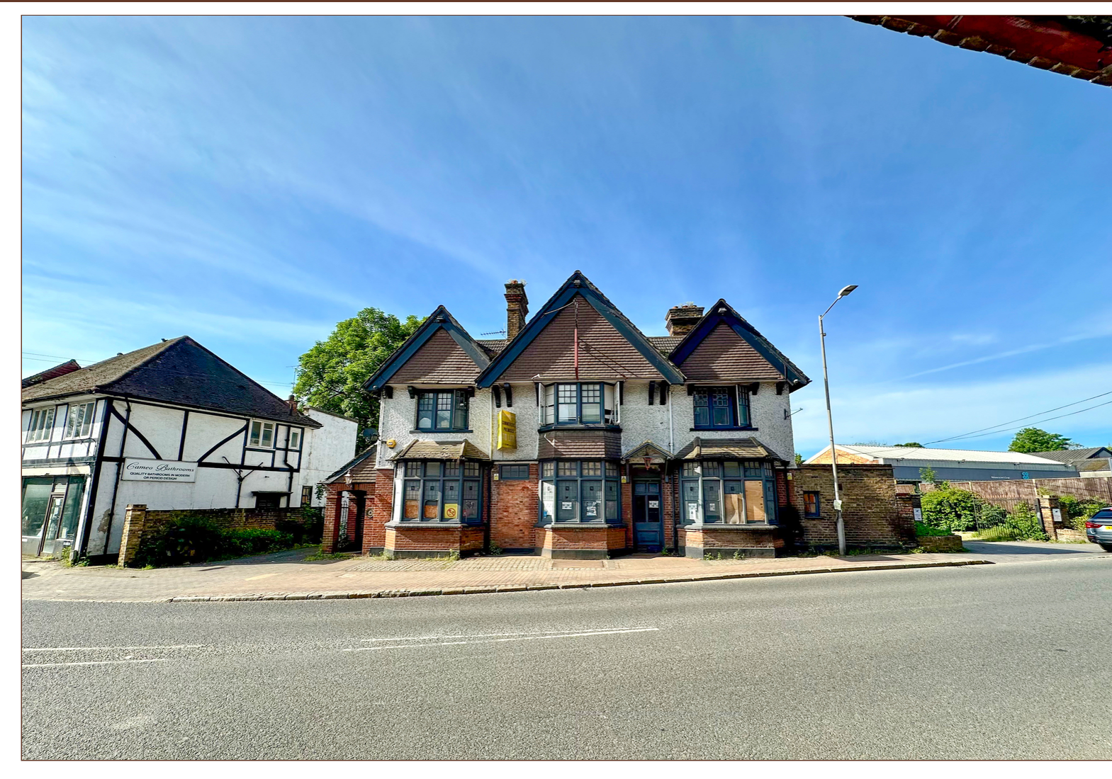
Bull" most recently as a restaurant and comprises a substantial 2-storey detached building situated on the south side of the High Street in Iver Village Centre and in the Local Shopping Centre and the Iver Village Conservation Area.

The property has full planning permission for the Conversion of the existing A3 restaurant with C4 residential above to C3 residential. Including 2 storey side extension to form 6 no flats. Conversion and 2-storey side extension to associated stables to form 2 no. duplex. Conversion of existing timber outbuilding to form bike store. A new 3-storey building to form 4 no flats. Total of 12 new dwellings.