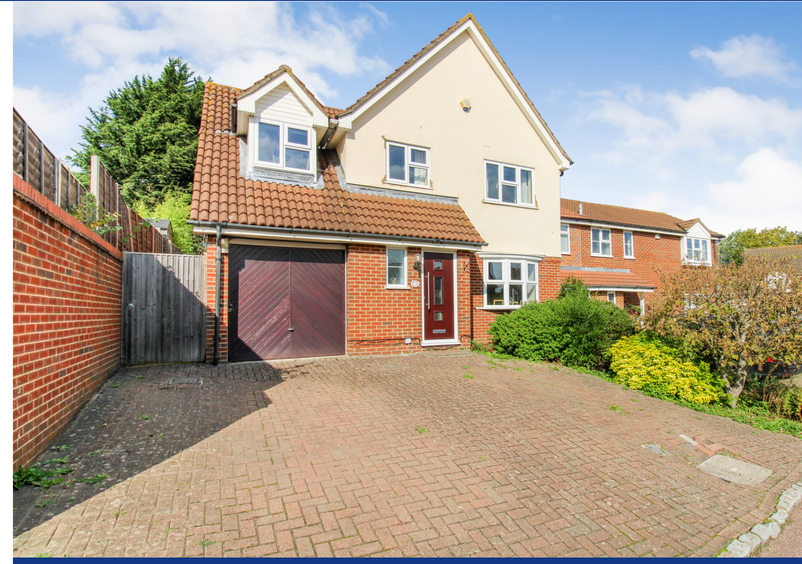
1 Thurnscoe Close, Lower Earley, Reading, Berkshire. RG6 4AL.