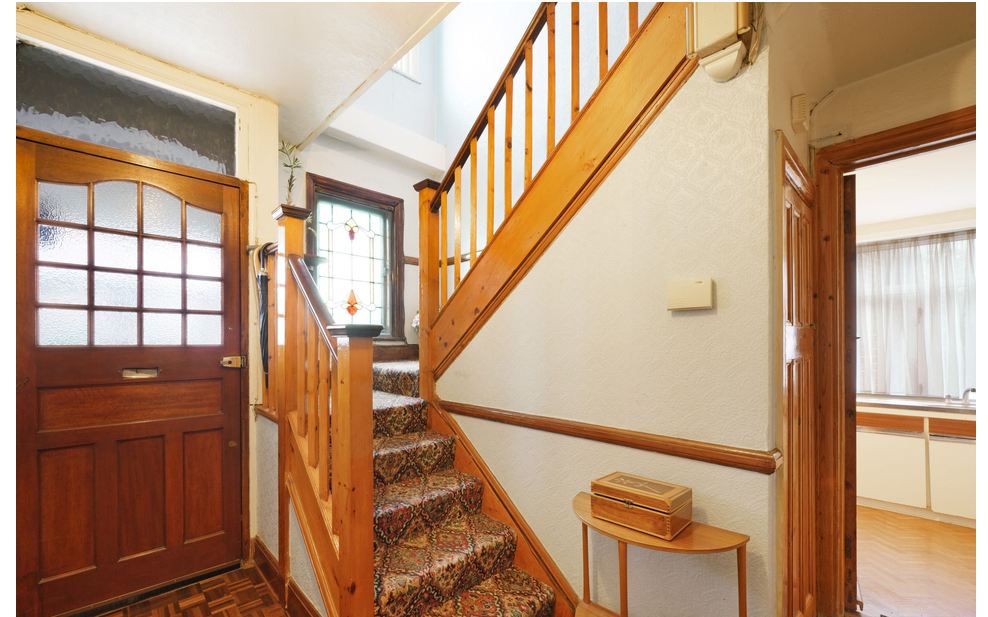
Wrotesley Road, Kensal Green, London NW10 5YE £1,050,000 - Freehold