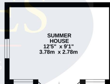
SUMMER HOUSE 12'5" x 9'1" 3.78m x 2.78m NOT LOCATED IN EXACT POSITION 113 sq.ft. (10.5 sq.m.) approx.