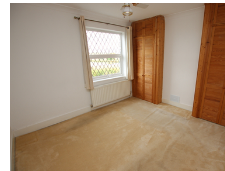
61 Pedley Lane, Clifton, Shefford, Bedfordshire, SG17 5QT