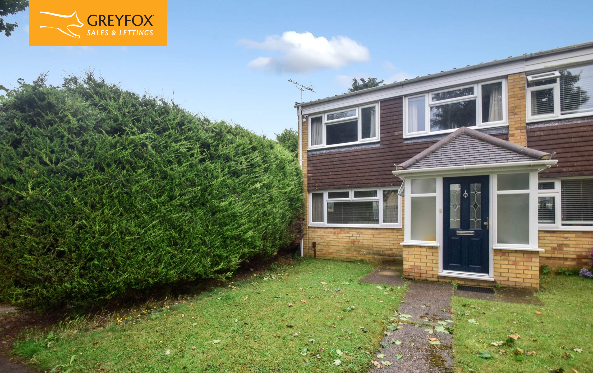
Three Bedroom End of Terrace House Thorpe Walk, Parkwood, Rainham, Gillingham, Kent, ME8 9QU