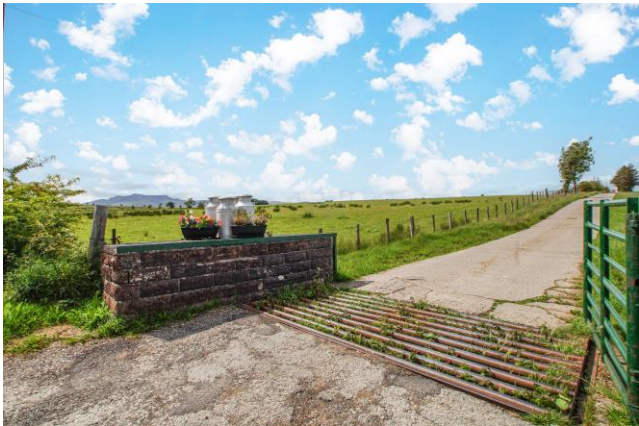
ACCESS & VIEW

OUTSIDE The property is situated in a courtyard with views to the rear towards the neighbouring woodland.