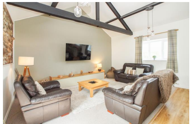
OPEN PLAN LIVING/DINING/KITCHEN

SHOWER ROOM (7'6 x 6'8) Three piece suite comprising WC, vanity unit wash hand basin and walk-in shower. Heated towel rail, UPVC double glazed frosted window to the front and wood effect laminate flooring.