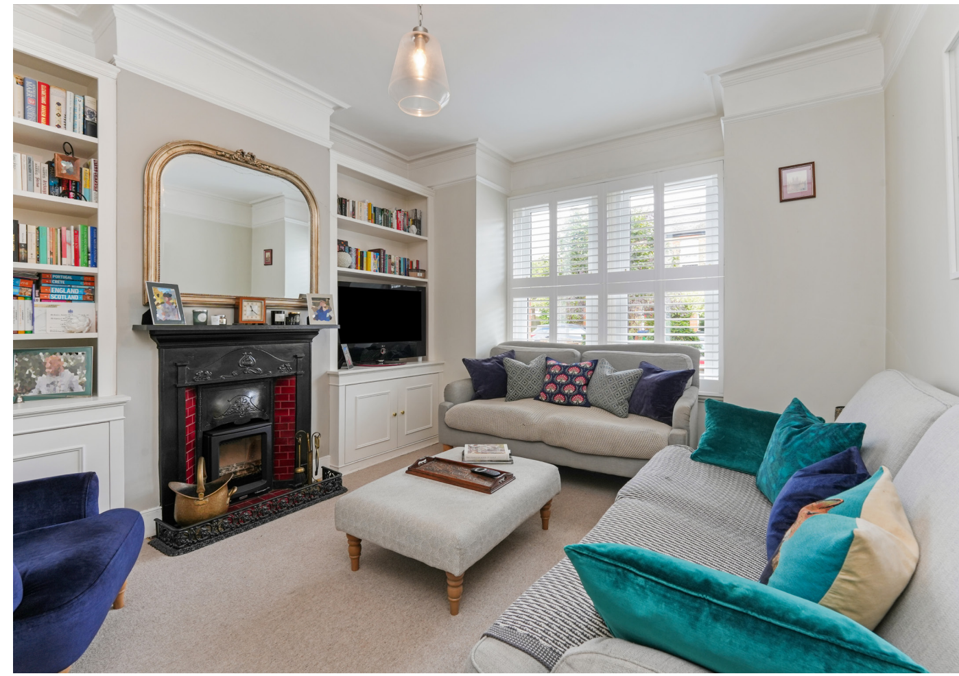
4 BEDROOM HOUSE