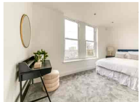
Warminster Road, London, SE25 4DQ