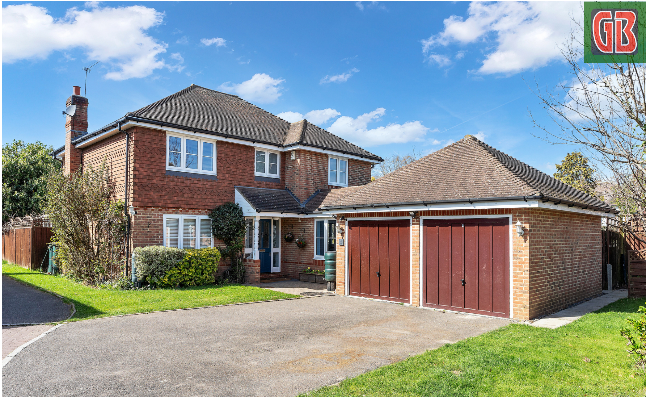
4 Charter Place, Staines-upon-Thames, Surrey. TW18 2HN. 4 Bedroom Detached House - £1,100,000 Freehold