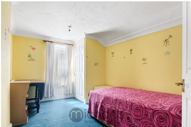
12' 1" x 7' 8" (3.68m x 2.34m) Window to rear aspect, radiator