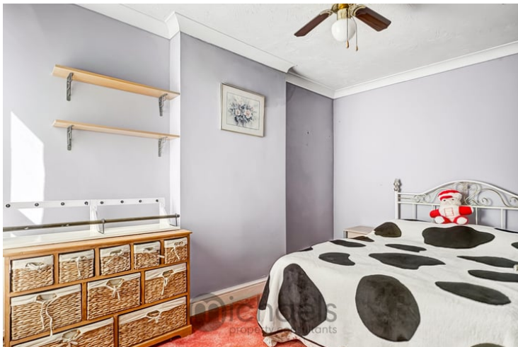
12' 2" x 8' 6" (3.71m x 2.59m) Window to rear aspect, radiator