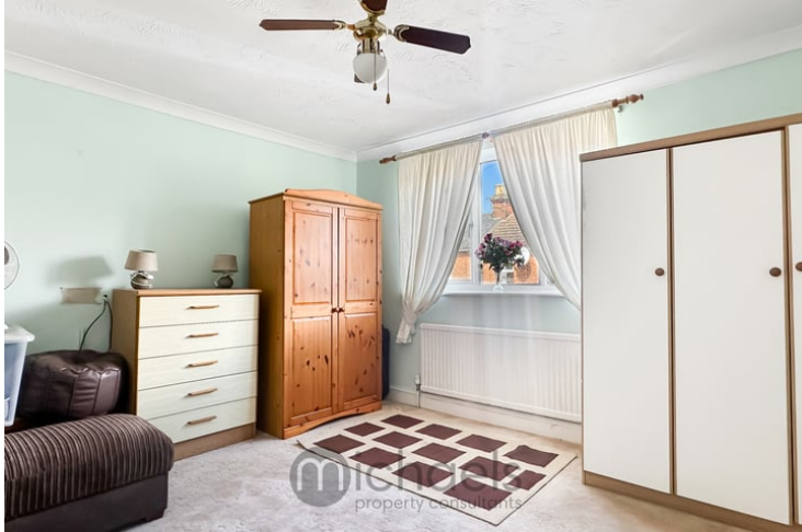
13' 2" x 11' 4" (4.01m x 3.45m) Window to front aspect, radiator