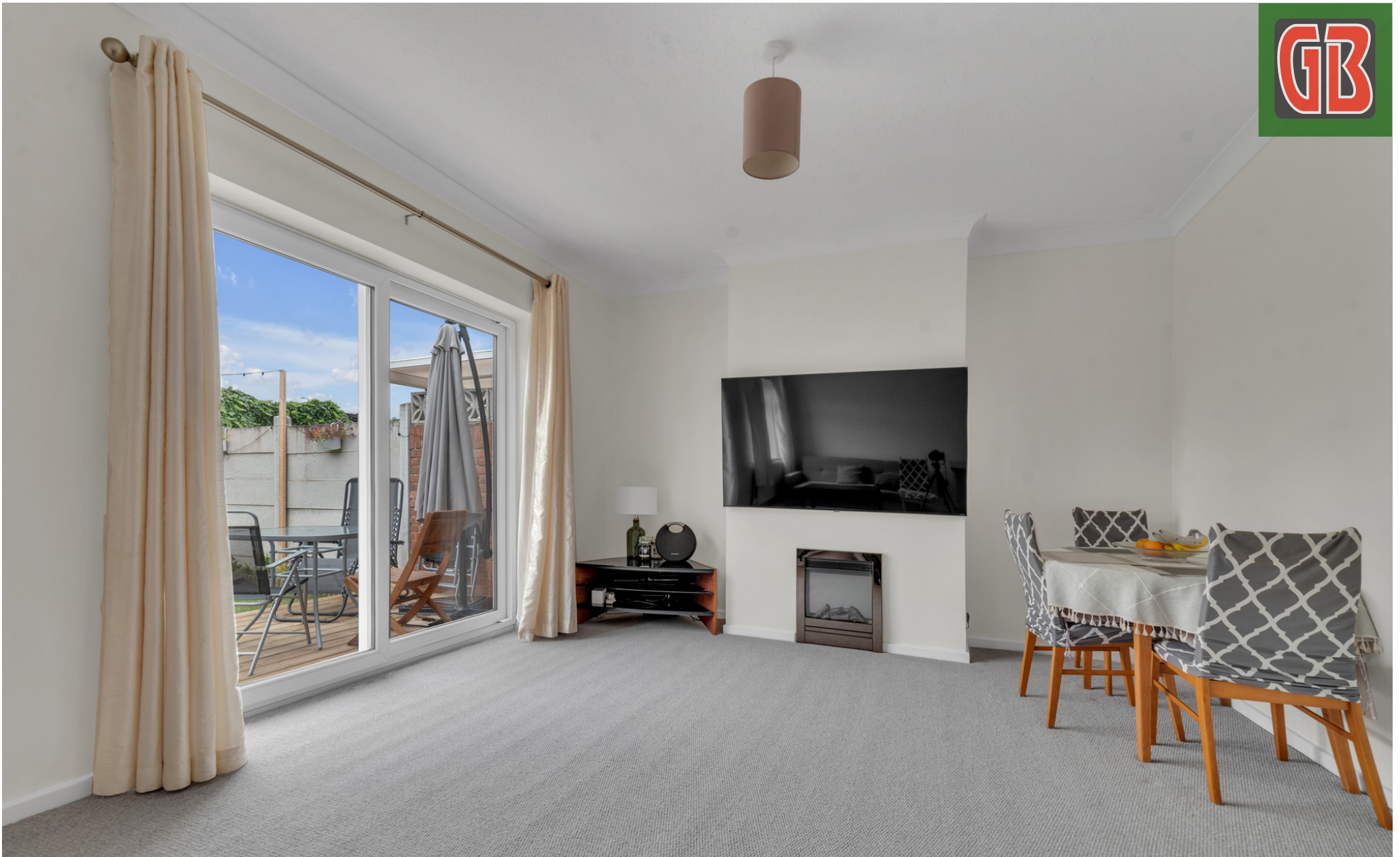
3 Brook Close, Stanwell, Staines-upon-Thames, Surrey. TW19 7AW. 2 Bedroom Semi-Detached Bungalow - £435,000 Freehold