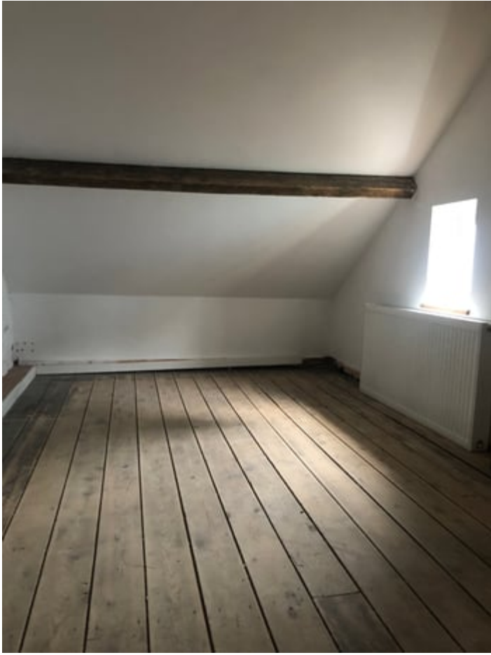
LOFT SPACE (SECOND IMAGE)