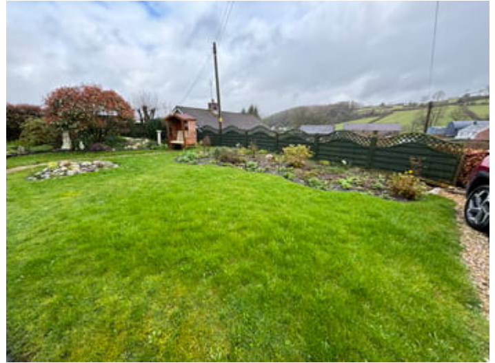
GARDEN (THIRD IMAGE)