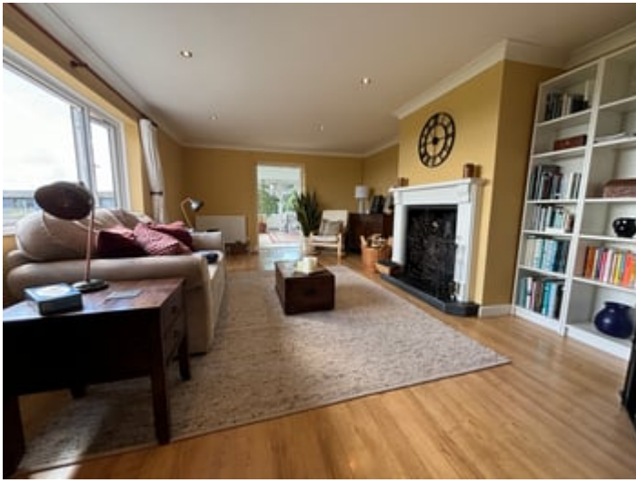
LIVING ROOM (SECOND IMAGE)