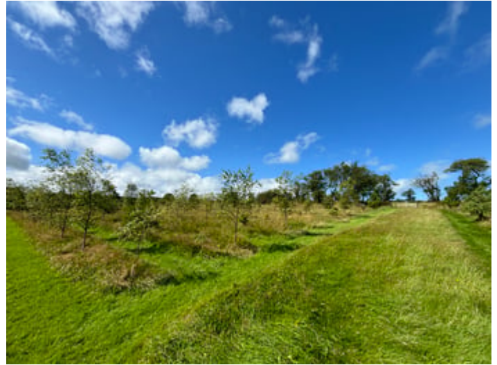
YOUNG WOODLAND (SECOND IMAGE)