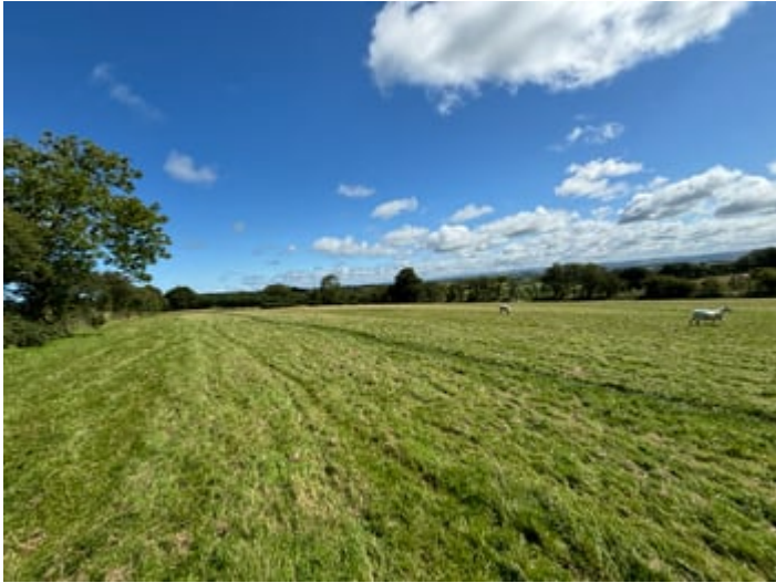
THE LAND (THIRD IMAGE)