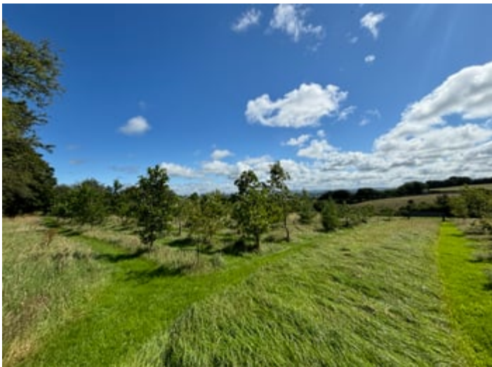
GARDEN (SECOND IMAGE)

Of approximately 400 mixed native trees planted in 2018/2019 centrally located within the land.