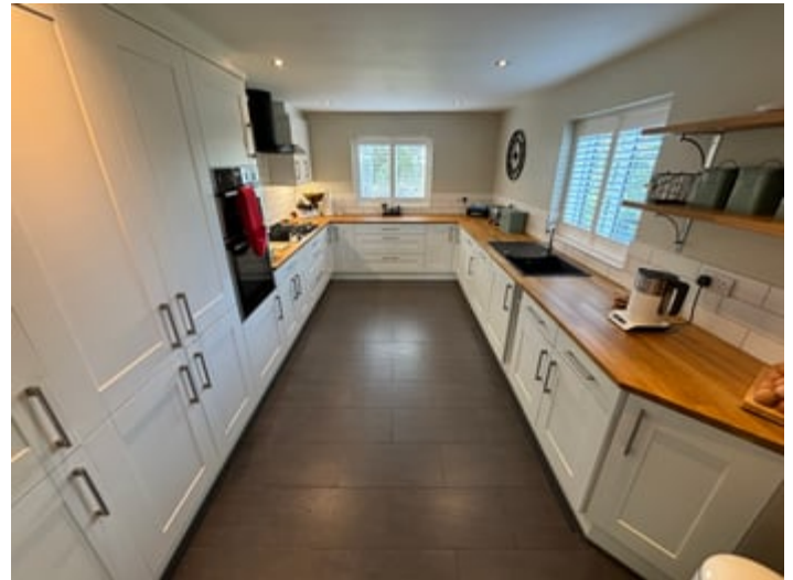
KITCHEN (SECOND IMAGE)

16' 0" x 10' 11" (4.88m x 3.33m). A stylish Shaker style fitted kitchen with a range of wall and floor units with hardwood work surfaces over, single sink and drainer unit, eye level double oven, integrated fridge and dishwasher, 5 ring LPG hob with extractor hood over, spot lighting, ceramic slate effect flooring, upright radiator and doubler aspect windows.