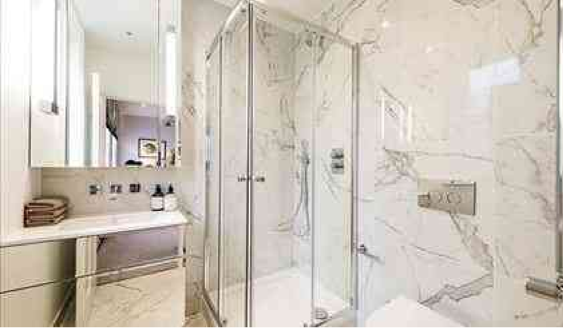
King Street, London, W6 0SP