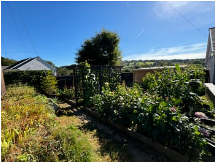
OFF LYING GARDEN (THIRD IMAGE)