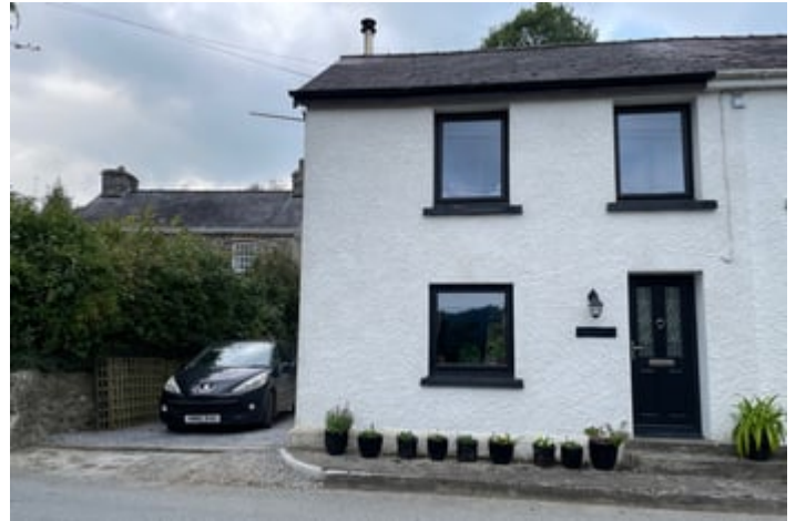
FRONT OF PROPERTY (SECOND IMAGE)