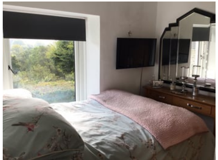
BEDROOM 1 (SECOND IMAGE)

8' 6" x 8' 0" (2.59m x 2.44m). With fantastic views over the Teifi Valley, feature fireplace.