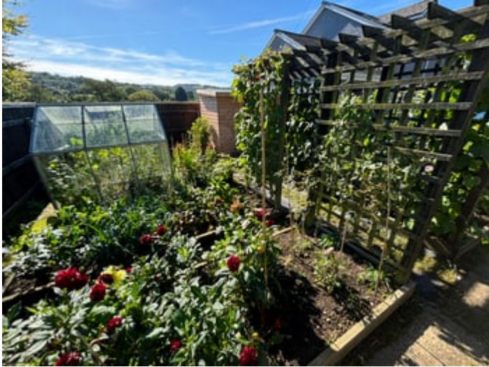
OFF LYING GARDEN (SECOND IMAGE)

Located adjacent to the cottage and having its own pedestrian gated access point. The garden has been developed by the current Owner and now offers highly productive raised beds, a newly built GARDEN SHED, and the GREENHOUSE. In all this property provides the perfect West Wales country escape.