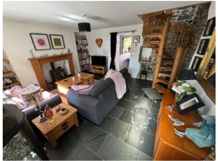
LIVING ROOM (SECOND IMAGE)

15' 6" x 12' 7" (4.72m x 3.84m). Having access via a composite front entrance door, slate flooring, open fireplace housing a cast iron multi fuel stove with solid oak surround, solid oak spiral staircase to the first floor accommodation, feature exposed stone wall.