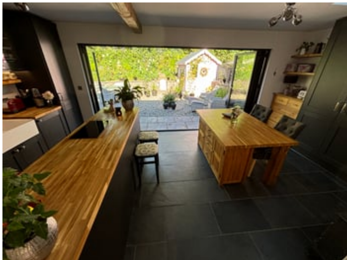
KITCHEN (SECOND IMAGE)

19' 4" x 10' 9" (5.89m x 3.28m). Stunning. An anthracite Grey Shaker kitchen with a range of wall and floor units with solid oak worktops and shelving, double Belfast sink, integrated fridge and freezer and washing machine, integrated oven and hob, feature plinth drawers, slate flooring, bi-fold doors opening onto a landscaped rear garden, cast iron multi fuel stove with an exposed flue, two Velux roof windows.