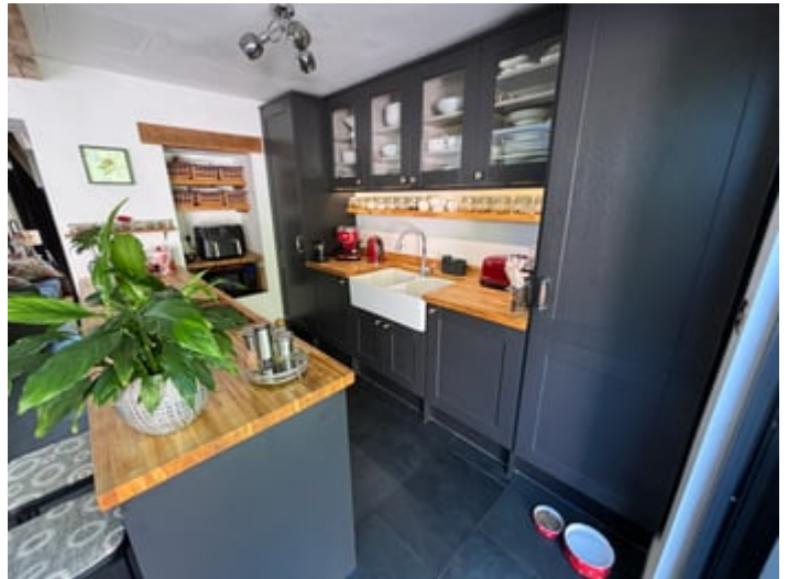
KITCHEN (FOURTH IMAGE)