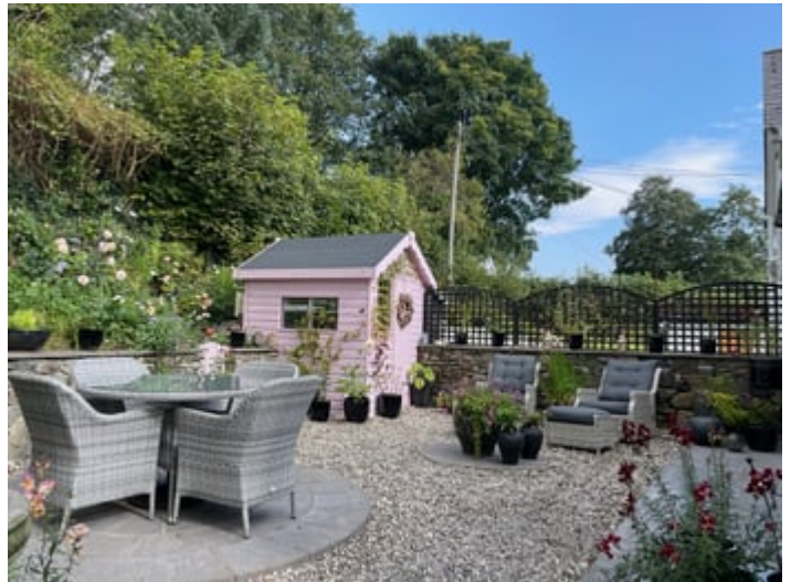
REAR GARDEN (FIFTH IMAGE)