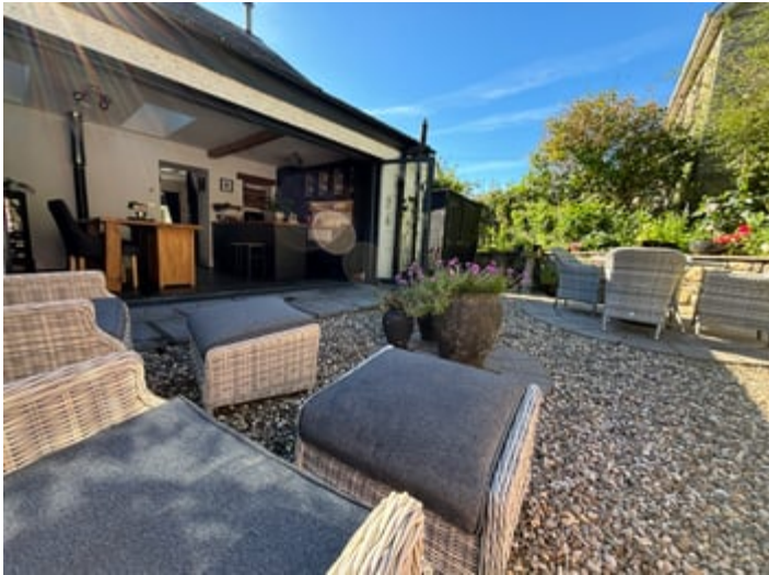
REAR GARDEN (SECOND IMAGE)

Recently landscaped with gravelled areas with circular paved patio areas with low stone walls with steps leading onto the terraced flower and shrub garden. There are mostly perennial plants that provides vibrant colours during Spring and Summer Seasons.