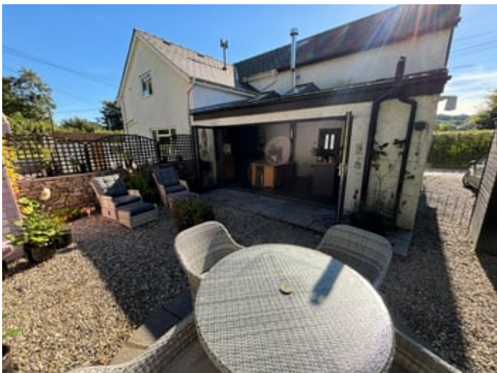
REAR GARDEN (THIRD IMAGE)