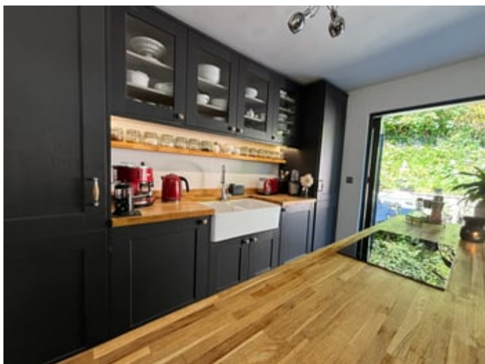
KITCHEN (SECOND IMAGE)