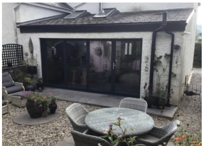
PRETTY GARDEN SHED