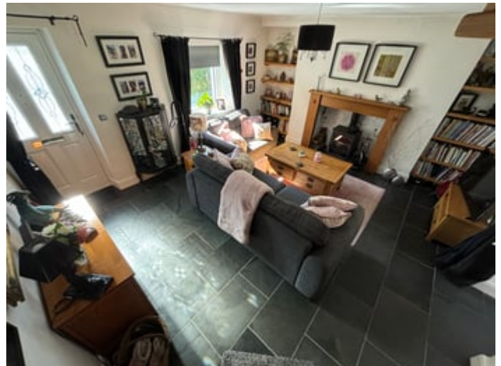
LIVING ROOM (THIRD IMAGE)