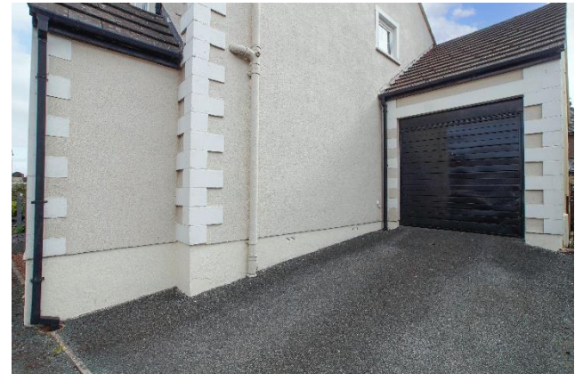
GARAGE & PARKING