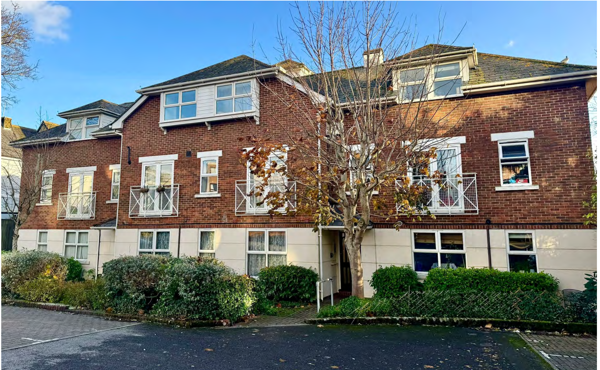
Seldown Towers, 47 Mount Pleasant Road, Poole BH15 1TH