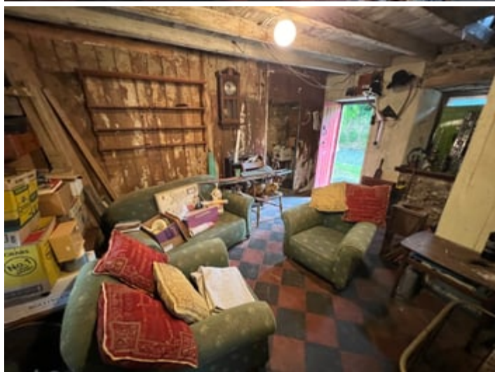
11' 2" x 16' 10" (3.40m x 5.13m) via hardwood door, red and black quarry tiled flooring, window to front and rear, multi fuel stove on a raised hearth, exposed stone walls, exposed beams. Door into -