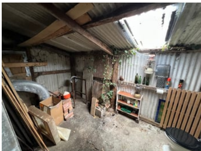
8' 6" x 13' 9" (2.59m x 4.19m) originally the kitchen of asbestos construction with a low level flush w.c. and water heater.