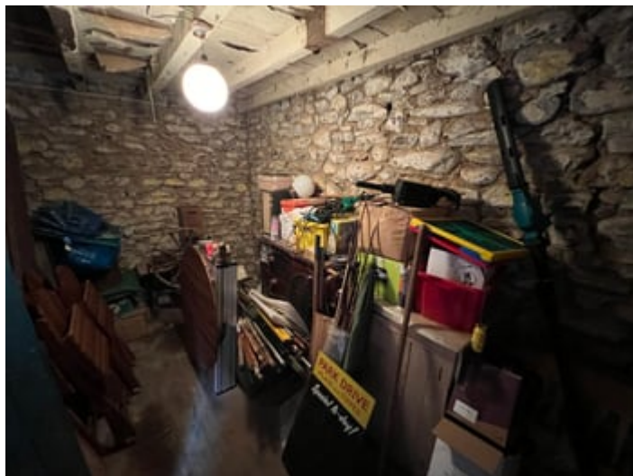
15' 0" x 6' 9" (4.57m x 2.06m) with window to front, exposed stone walls, beams to ceiling.