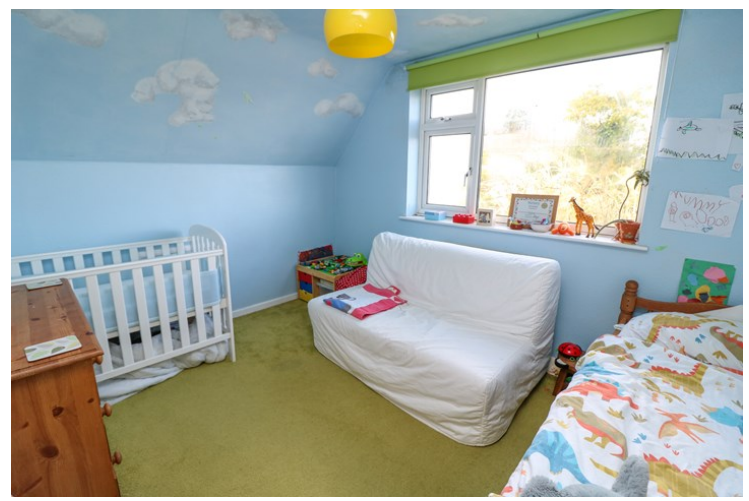
12' 5" x 9' 7" (3.78m x 2.92m) With window to side, radiator, two eaves cupboards.