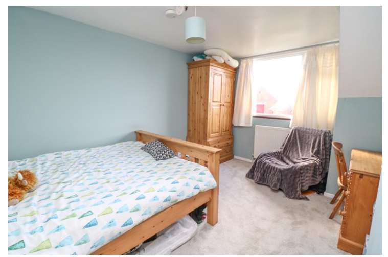
14' 3" x 10' 5" (4.34m x 3.17m) With window to front, radiator.