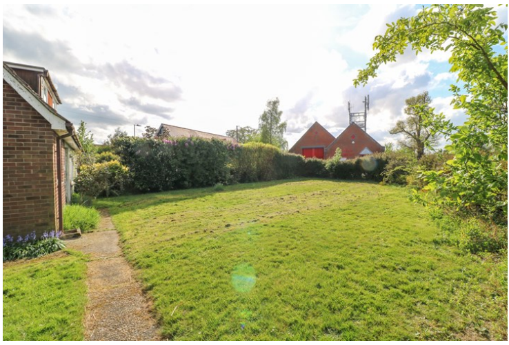
A large front garden laid to lawn.