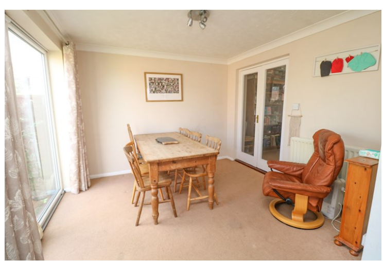
10' 1" x 9' 7" (3.07m x 2.92m) With patio doors to rear, radiator.