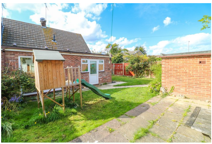
Enclosed by fencing with gated rear access, lawn area and a patio area suitable for outdoor furniture, gate leading to front garden.