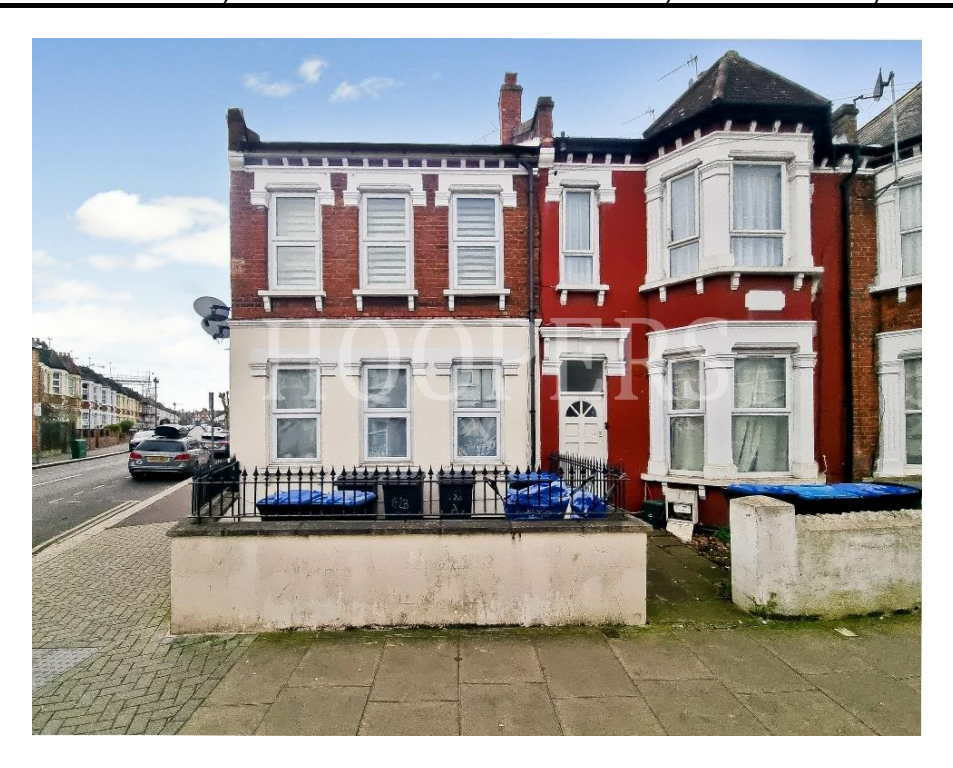
EPC Rating: D

We are delighted to bring to the market this two bedroom ground floor flat offering ideal first time buyer accommodation or potentially a good buy-to-let investment.