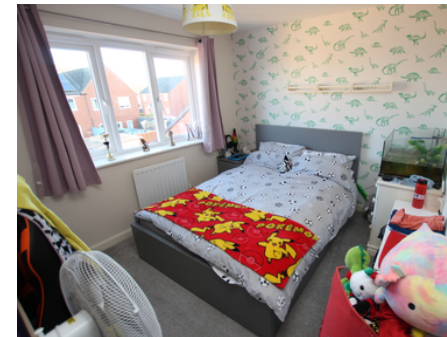
34 Woodpecker Mead, Lower Stondon, Henlow, Bedfordshire, SG16 6FU