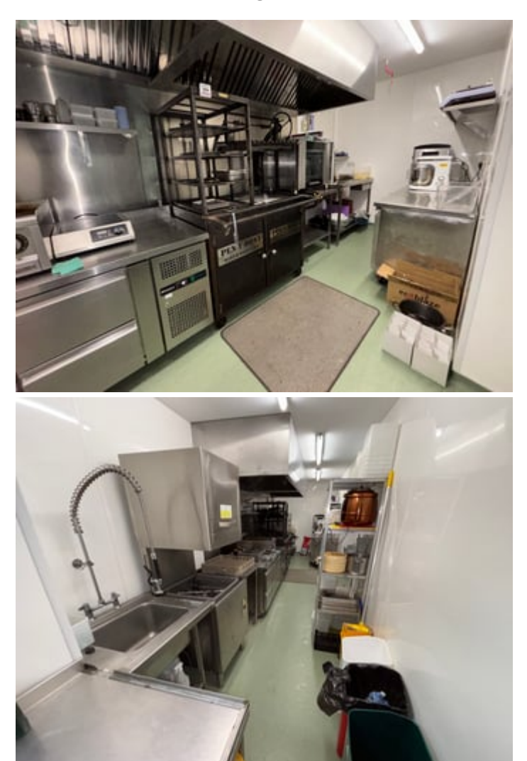
Wash Room 10' 6" x 5' 6" (3.20m x 1.68m) stainless steel sink units with

23' 6" x 6' 9" (7.16m x 2.06m) open area to the restaurant so that the chef and cook can be observed preparing the meals if required, fully equipped and recently refurbished with stainless steel catering kitchen with commercial oven, electric grill, 3 x induction hobs, bespoke charcoal grill, extractor canopies, dishwashing unit, 2 x fridges, glass washer, ice and coffee machines, access through to: