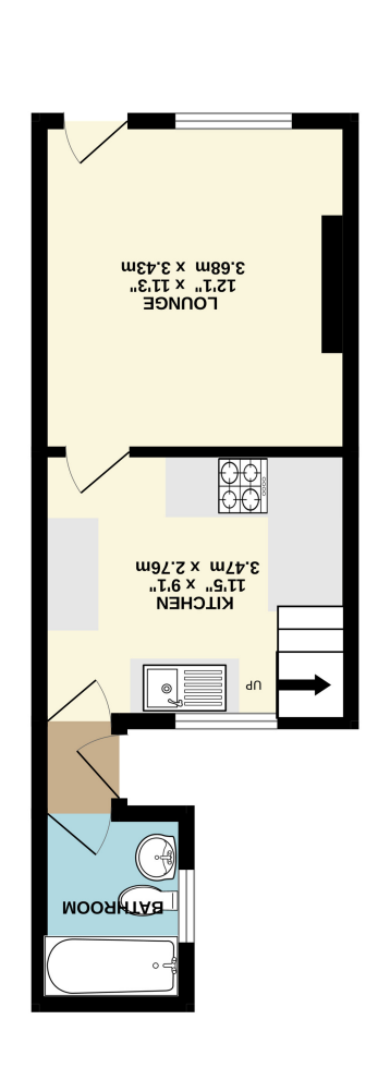
GROUND FLOOR 287 sq.ft. (26.7 sq.m.) approx.