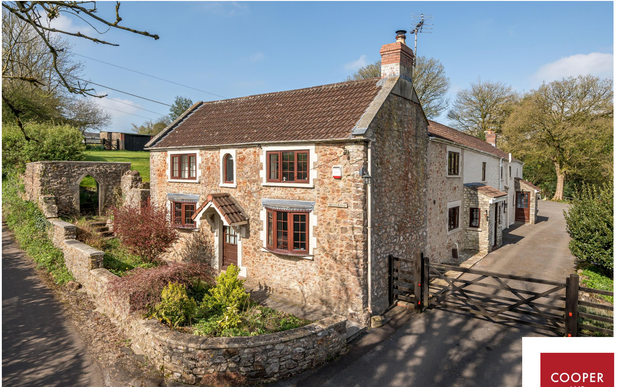
Wesley Cottage, Moorwood, Nr Oakhill, BA3 5BN