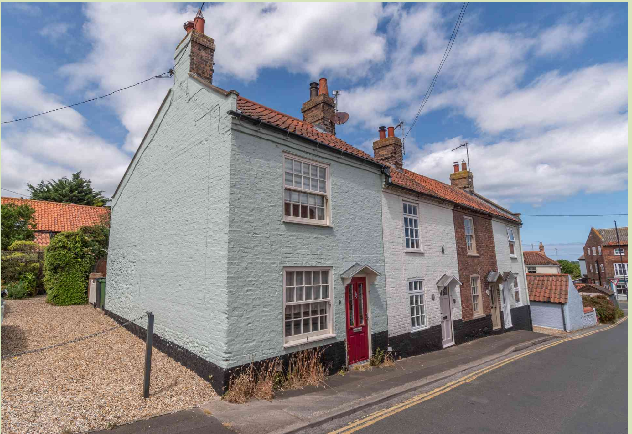
Amica Cottage, Wells-next-the-Sea Guide Price £399,950