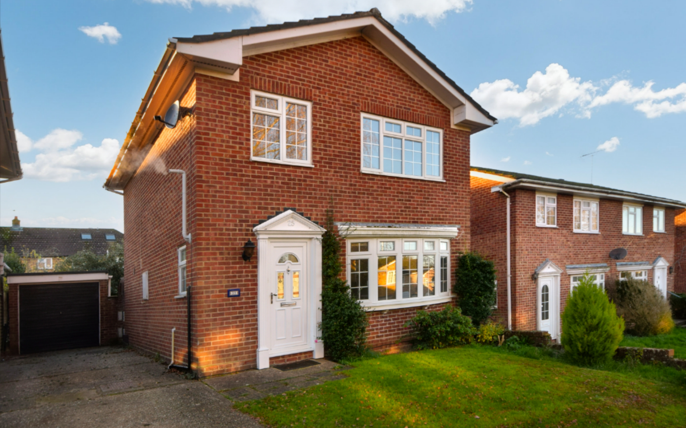
25 Pilgrims Close, Farnham, Surrey. GU9 8QP. Guide Price £585,000